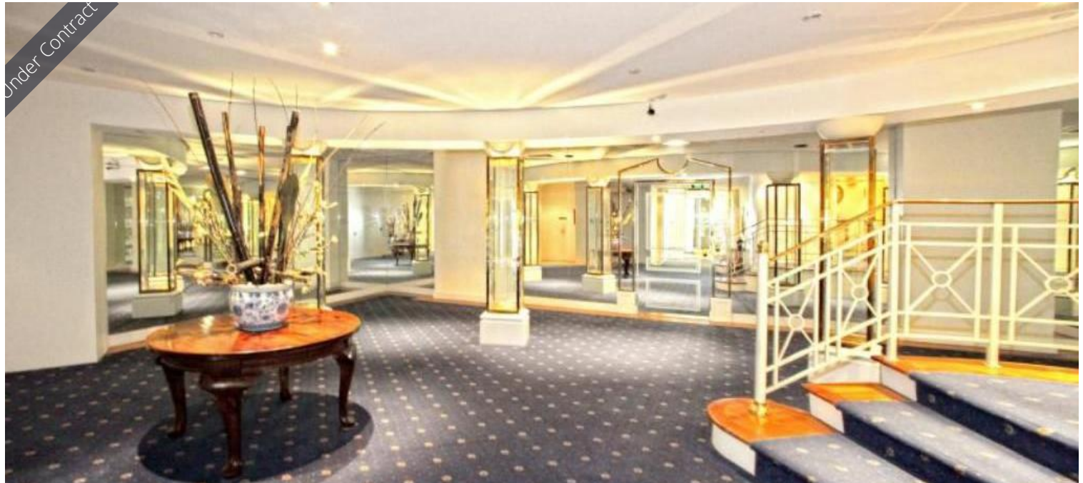
Unit 69, 145 Canterbury Road, Toorak