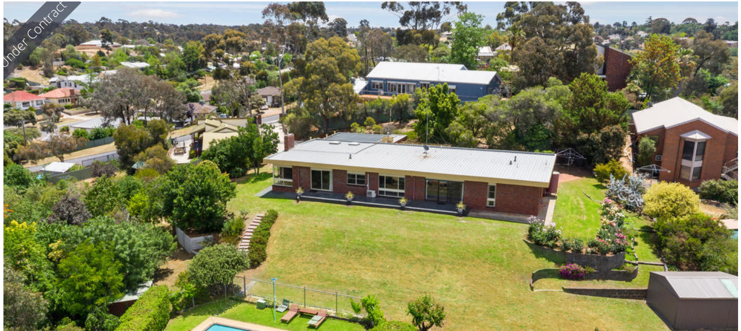
311 Rowan St, Golden Square